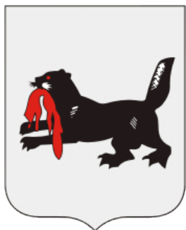
The Ministry of culture and archives of the Irkutsk region