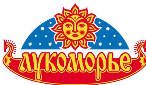
LLC «Baikal investment company», LLC "Sayany", LLC "Lukomorye"